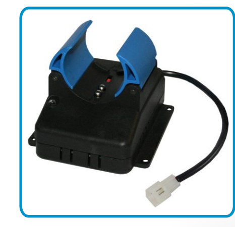
Flashlight charger with LED charging indicator.