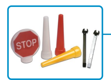
L500 Series accessories range